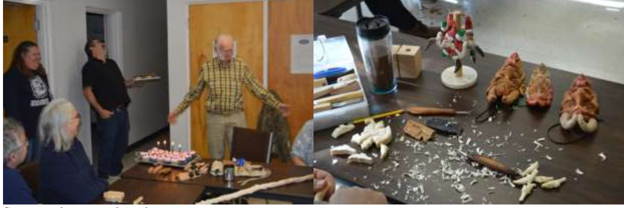
Some Christmas gifts in the making