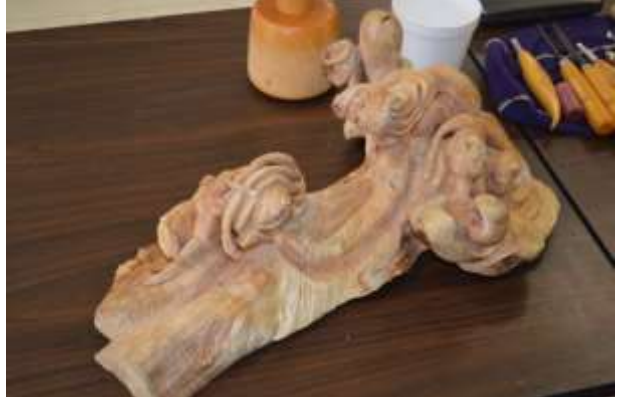
Another project coming along.

Please remember that our dues run from January to December on the calendar year. Please check with our membership director to verify your status which is on your mailing label.