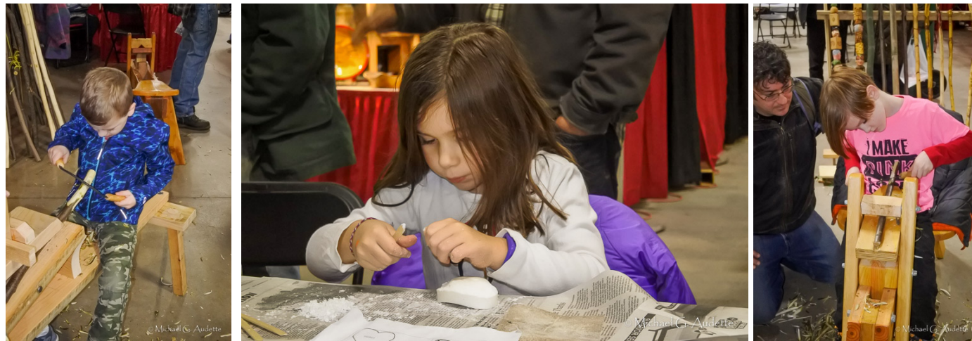
New England Woodworking Show at the Big E fairgrounds Agawam Ma