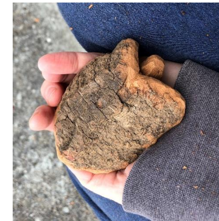
Brooke's turtle & bird