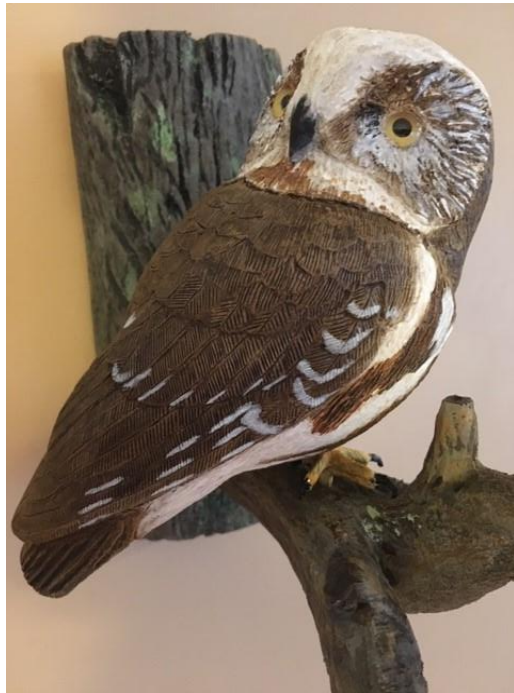
Pierce's Sawette Owl