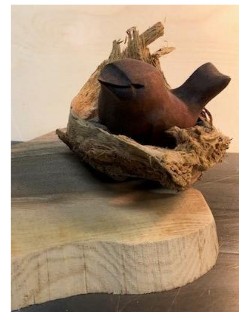
Paul adds scrimshaw & Tackles a white throated sparrow