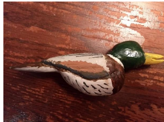
Phil's duck in progress

My Fellow Woodcarvers, This Issue is devoted to members sharing current projects with other members. Please consider sending more pictures for our next issue. And believe that there will be a return to a more normal life beyond the surreal Covid19 landscape that we are currently in. So whittle away - there will be plenty of opportunities to show off your accomplishments in person at future club events.